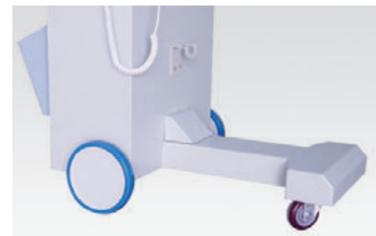
The flexible movement of the unit thanks to main wheel and direction wheel design.