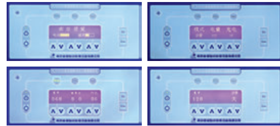
Compact operation panel, intuitive interface, easy to operate.