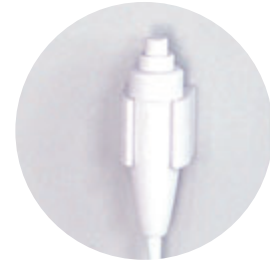
Two gears exposure hand brake

More details Less dose Convenient Safety