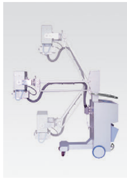
Rocker can move up and down, automatically balance