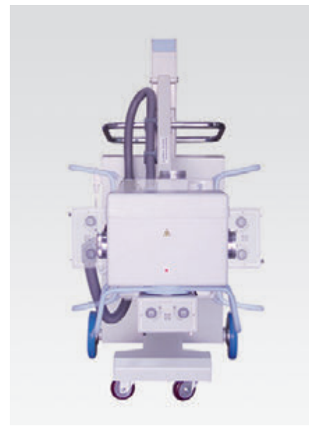
High quality X-ray monoblock can rotate in \pm 90^\circ