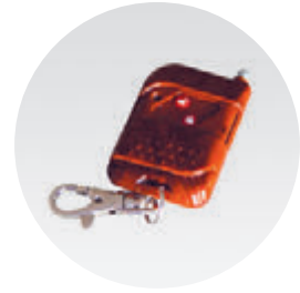
Remote hand-held controller (available in 20 meters)