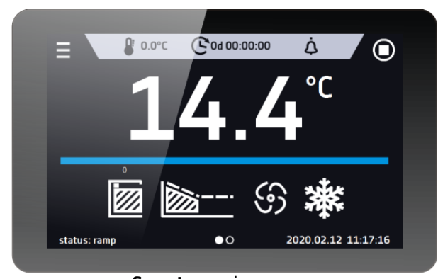
Smart - preview screen