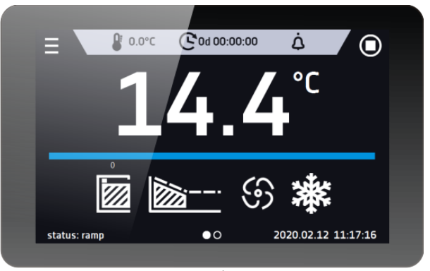
Smart - preview screen