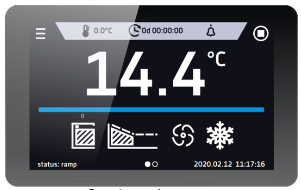
Smart - preview screen