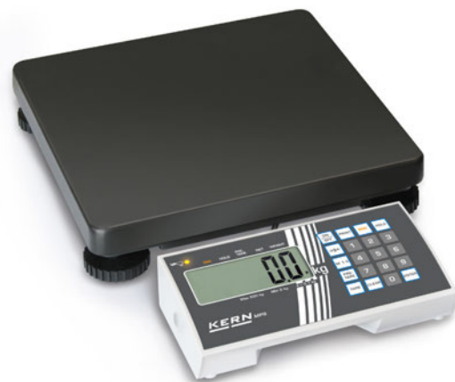
KERN MPS-M with free-standing display device