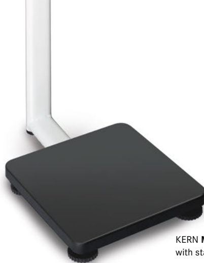
KERN MPS-PM with stand