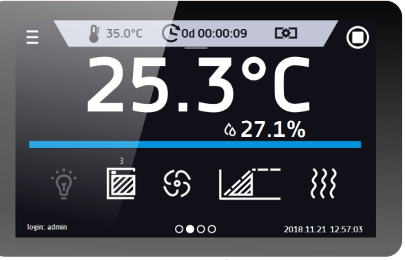
Smart PRO - preview screen