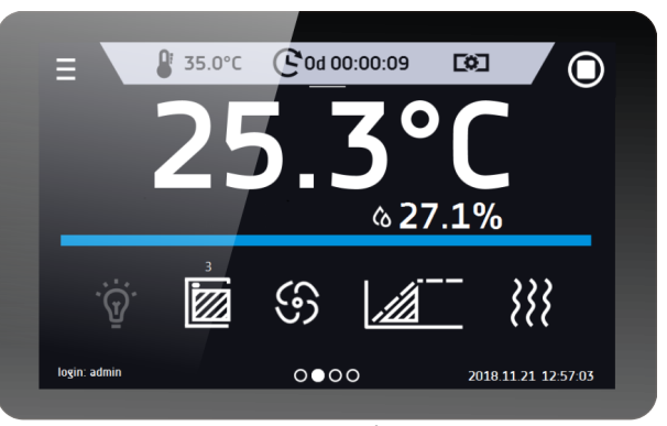
Smart PRO - preview screen