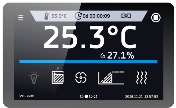
Smart PRO - preview screen