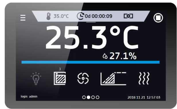
Smart PRO - preview screen