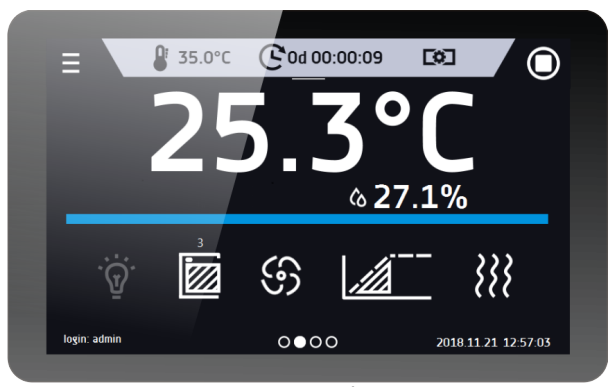
Smart PRO - preview screen