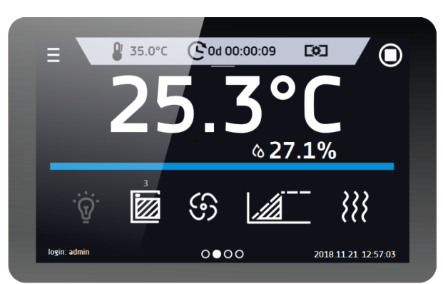
Smart PRO - preview screen