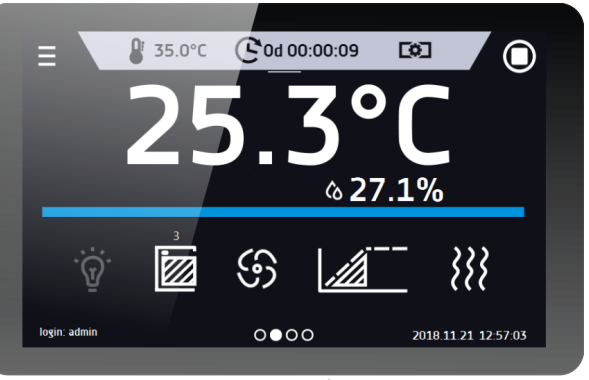
Smart PRO - preview screen