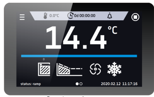
Smart - preview screen