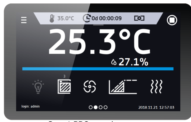
Smart PRO - preview screen