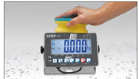
Stainless steel display device with IP68 protection, hygienic and easy to clean