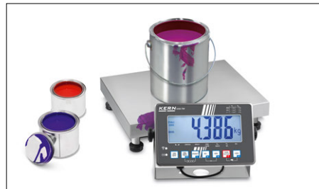
Durable stainless steel weighing plate