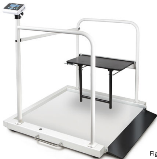
Fig. shows MWA 300K-1M + MWA-A04

Wheelchair scale with integrated ascending ramp and handrail set with folding patient seat – with EC type approval class III and approval for professional, stationary medical use in medical diagnostics