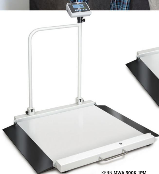
KERN MWA 300K-1PM