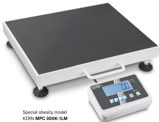
Special obesity model KERN MPC 300K-1LM