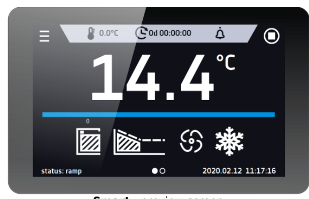
Smart - preview screen