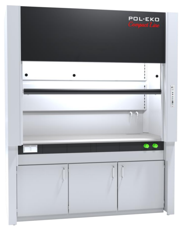
The photo above is for reference only, may show additional options not included in standard equipment. The real appearance, particularly color and structure of the material may differ from the ones presented in the photo.