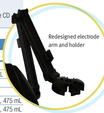
Redesigned electrode arm and holder

For more information, contact your local Thermo Scientific products dealer or call our customer and technical service experts at 1-800-225-1480 (for the US and Canada) or visit www.thermoscientific.com/water .